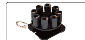
auto 8-cell holder (optional)