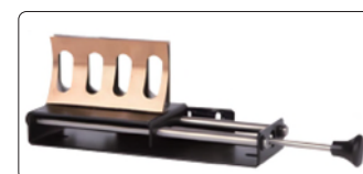
manual 4-position film holder (optional)