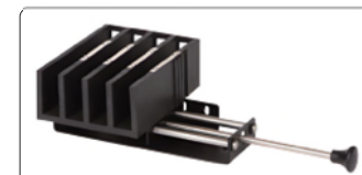
manual 4-cell holder (optional)