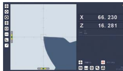
checking blade geometry quickly