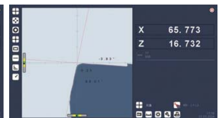
dynamic crosshair automatically adjusting as X and Z axes move, and the cutting tools can be quickly measured through the dynamic crosshair.