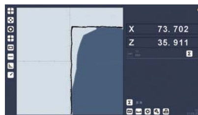
scanning the maximum profile of cutting tools