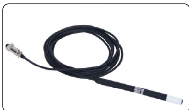
humidity sensor (optional)