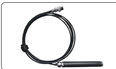
atmospheric pressure sensor (optional)