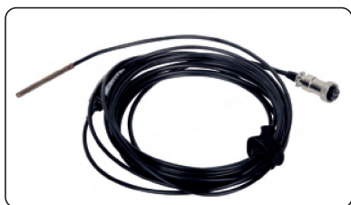
platinum resistance PT100 (optional)