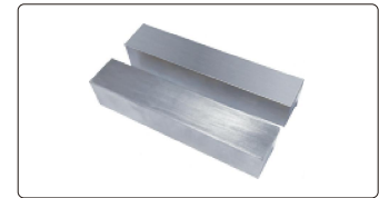
side pressure block (included)