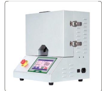
concora medium fluter (optional)