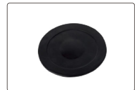
adhesive film (included)