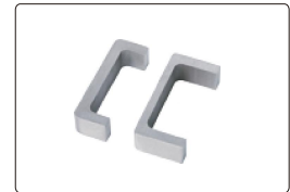
height gauge (included)