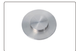
coaxiality gauge (included)