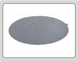
silicon carbide paper(included)

** □□ is granularity specification, for example, code MLP-DLA40 stands for 40um