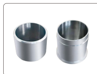
stainless steel graduated cylinder (optional)