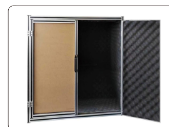
soundproof box (optional)