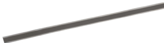
steel linear scale LSA-B1