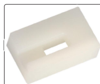
assistant tool (optional)

* Customized length (max. 10m) according to customer requirements