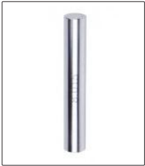
calibration gauge (included)