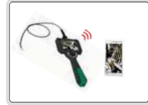
WIFI real-time image transmission