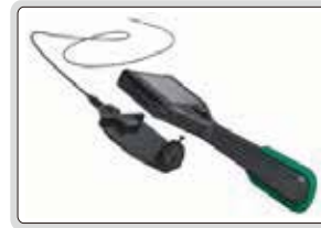
changeable lens cable