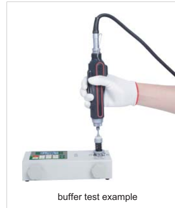
buffer test example