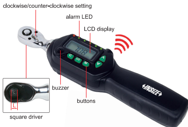
IST-42W12A type A