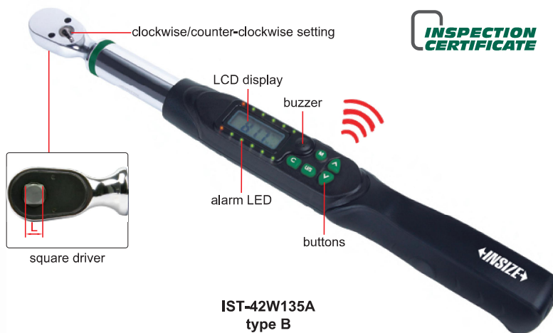
IST-42W135A type B