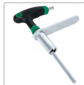
torque adjustment tool (optional)