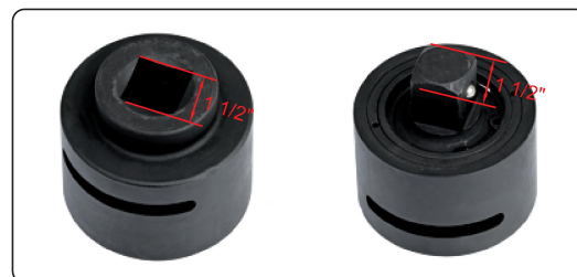
1 1/2" ratchet head (optional)