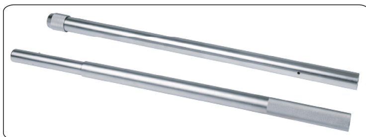
extended handle ( IST-39WM1000 , IST-39WM1500 , IST39WM2000 , IST-39WM3000 included)