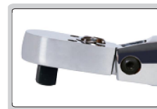
swing-head ratchet head