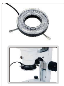
LED ring light (optional)