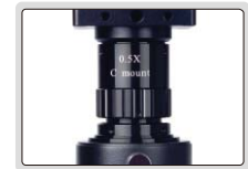
0.5X camera adapter (included)