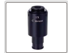
1X camera adapter (optional)