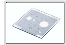
calibration plate (included)