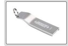
16G USB flash disk (included)