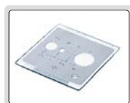
calibration plate (included)