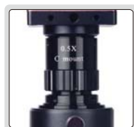
0.5X camera adapter (included)