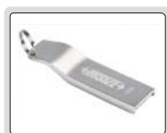
16G USB flash disk (included)