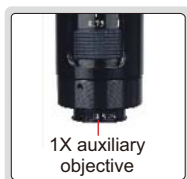
1X auxiliary objective (included)