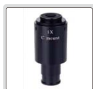
1X camera adapter (optional)