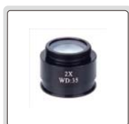
2X auxiliary objective (optional)