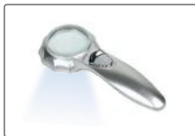
magnifier with LED (included)