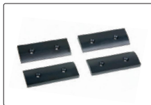
supports for cylinder or tube workpieces (included)