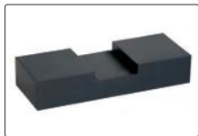
flat anvil for test block (included)