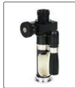
measuring microscope (included)