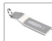
software flash disk (included)