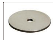
calibration block (included)