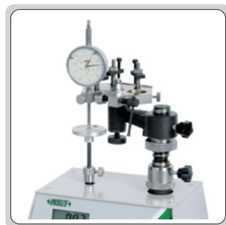
check the measuring force of dial indicator