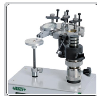
check the measuring force of dial test indicator