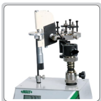
check the measuring force of indicating micrometer