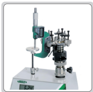
check the measuring force of micrometer