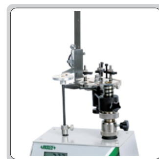
check the measuring force of caliper