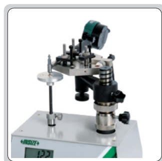
check the measuring force of bore gage