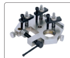
clamping disk (included)