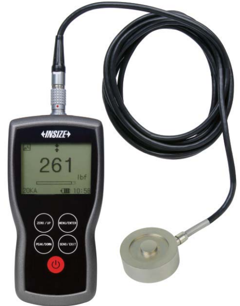
ISF-DF10KC type C