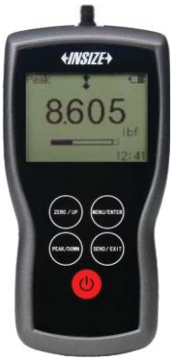
ISF-DF100A type A