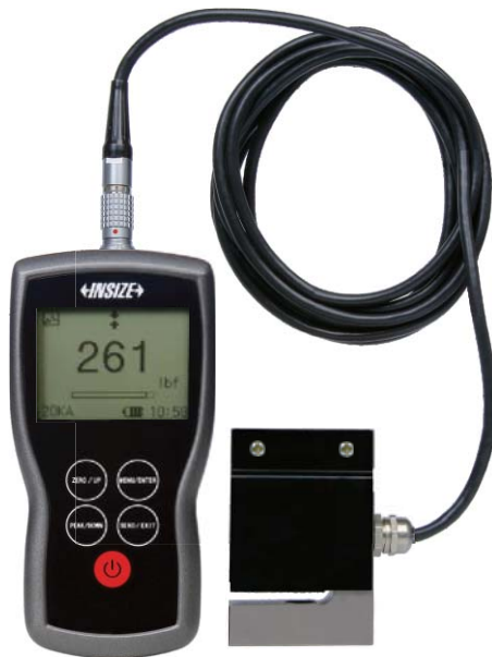
ISF-DF5KA type B