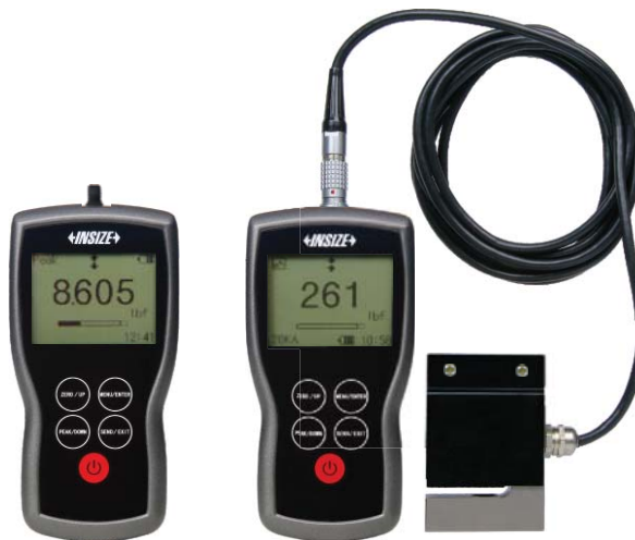
ISF-DF100A type A