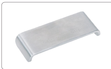
316 stainless steel standard block(included)