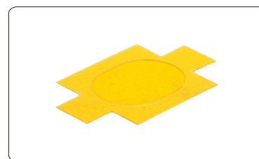
window protection film(included)