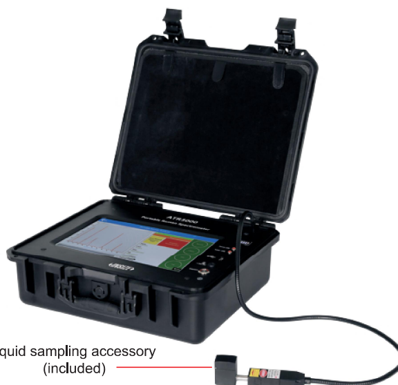
liquid sampling accessory (included)