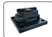
slice holder (optional)