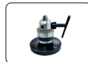
cylinder holder (optional)