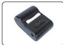
wireless printer (optional)