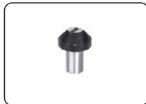
small V-type anvil (optional) for cylinders with .08~.16" DIA