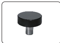
2.28" DIA flat anvil (included)