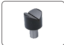
V-type anvil (included) for cylinders with .16~2.36" DIA