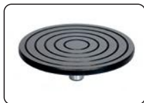
5.91" DIA flat anvil (included)