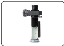
measuring microscope (included)