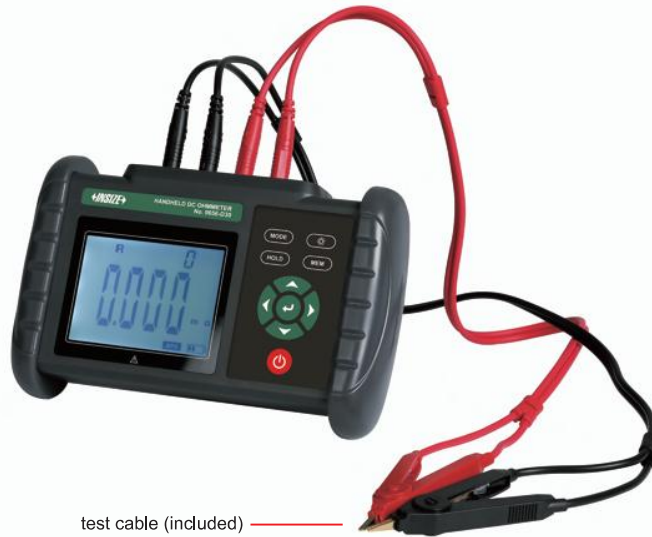
test cable (included)

computer software (9656-D300 included): connect to PC software via USB cable to export the data from the instrument