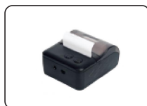
bluetooth printer (included in 9646-301)