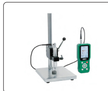
stand (optional), suitable for measuring small workpieces, fast and stable