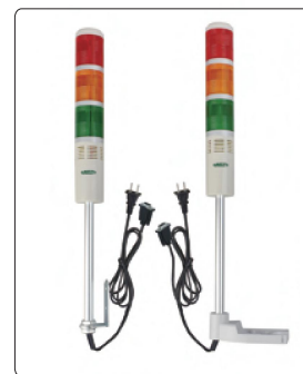
alarm light (optional)