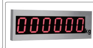
large display (optional)