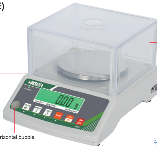
detachable wind deflector