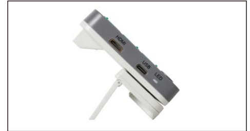
Side and back

After the handle is folded, the magnifier can be directly placed on the object for observation