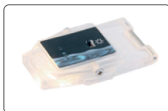
lighting cover plate (optional)