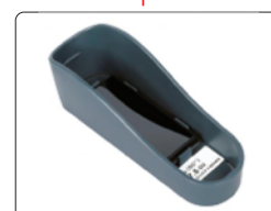
base with calibration block (included)