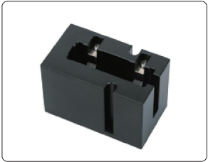
1.97" cell holder (included)