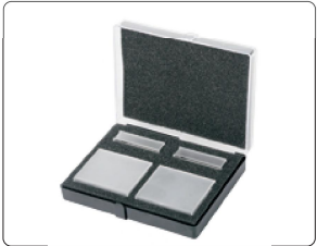
glass cuvettes (included)