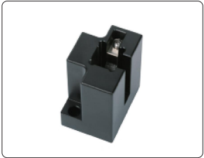
.39" cell holder (included)