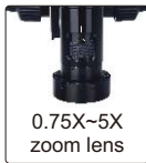
0.75X-5X zoom lens