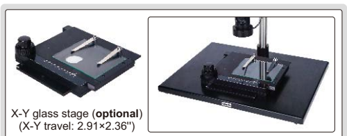
X-Y glass stage (optional) (X-Y travel: 2.91×2.36")