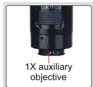
1X auxiliary objective (included)