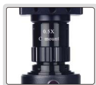
0.5X camera adapter (included)