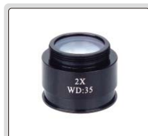
2X auxiliary objective (optional)