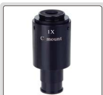
1X camera adapter (optional)