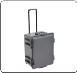
carrying case (optional)