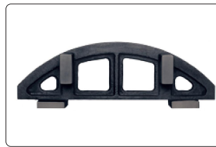
calibration block (optional)