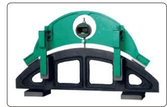
calibration block application