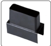
glare shield (included)