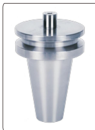
gauge master (optional)