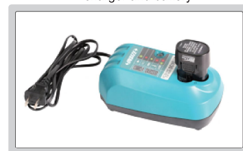
charger and battery