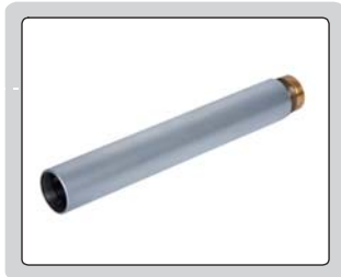
extension rod (included)