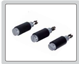
2" replaceable measuring jaws(included)